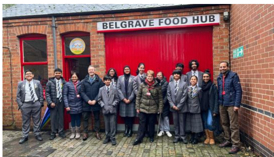
Pupils from Rushey Mead at the Food Hub

You will have received notification of your rent increase for this year. It's always painful for us to have to raise the rent, but with contractor and other costs continually going up, it's a financial necessity.